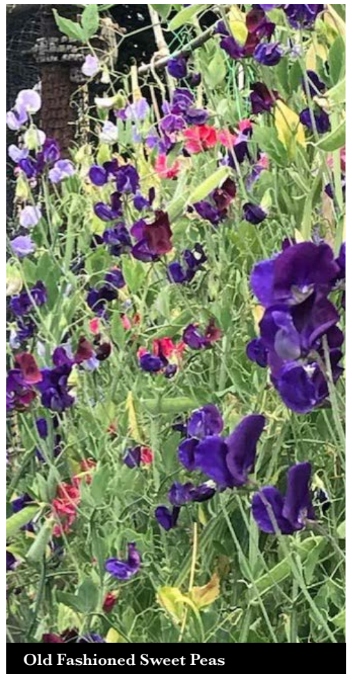
Old Fashioned Sweet Peas