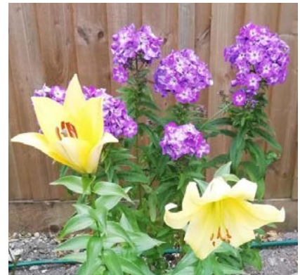
Lilies and Phlox