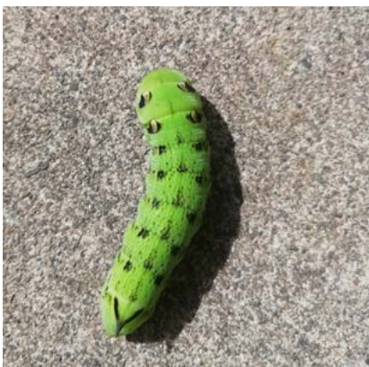
Elephant Hawk Moth Caterpillar