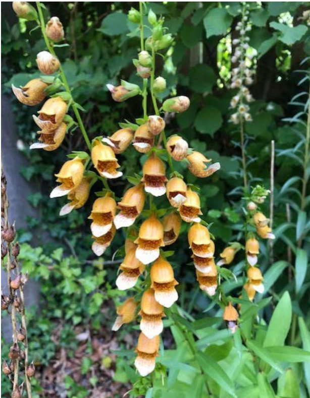
Digitalis Ferruginea doing well under a beech tree!