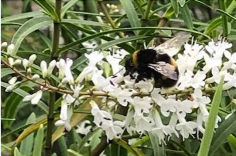
Bumble bee on White Hebe