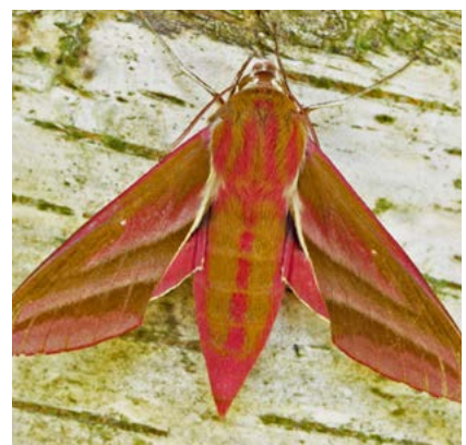
Elephant Hawk Moth