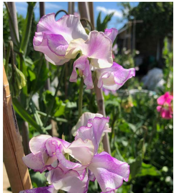
Sir Jimmy Shand Sweet Pea

Remember send in photos of your garden to horticultural.society@btconnect.com Don't forget to enter the container competition closes last day of July, see the link below for full details www.laceygreen.com/Sections/Alternative/Container%20 competition%202020.pdf