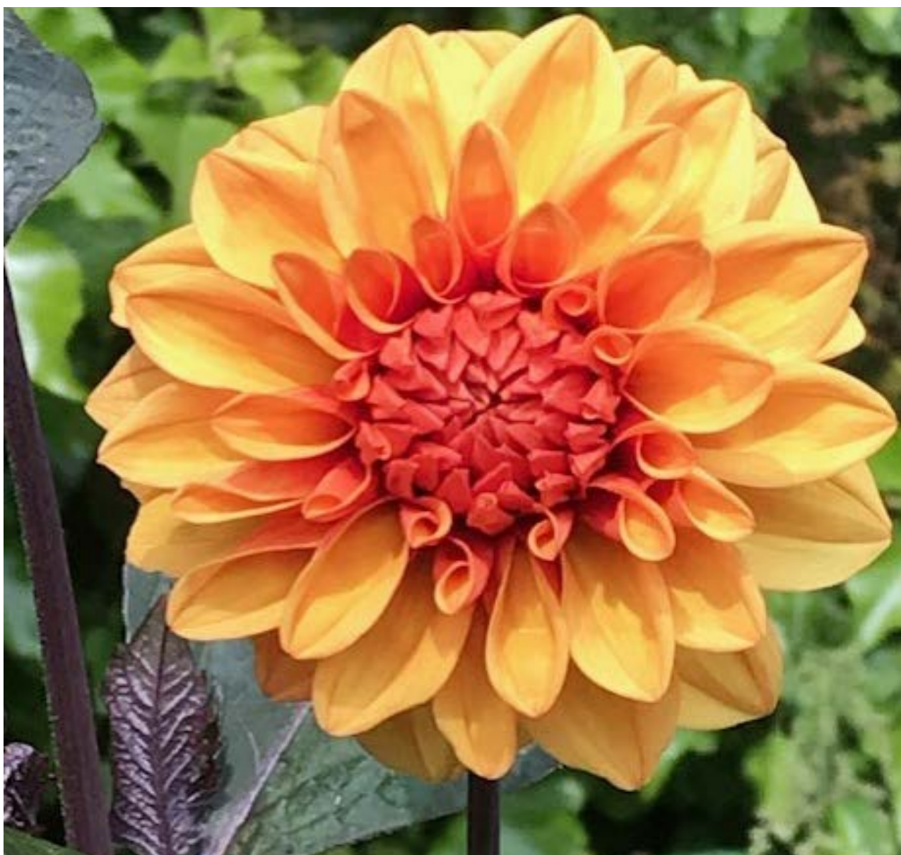
Dahlia