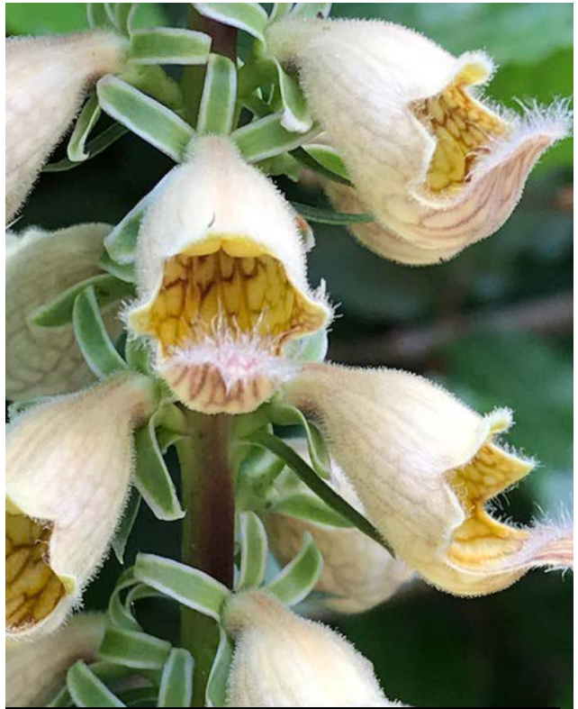
Digitalis Ferruginea close up