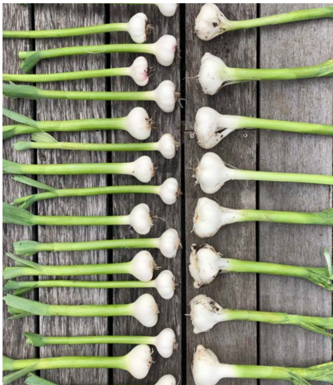
Carcassonne Garlic v's Elephant Garlic