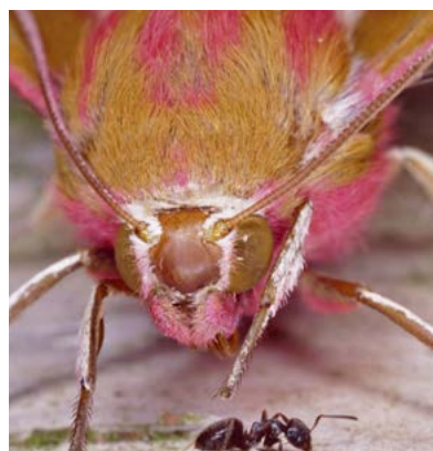
Elephant Hawk Moth